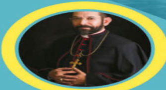
BISHOP DANIEL FLORES will celebrate Friday evening mass